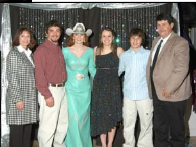
The Rice Family