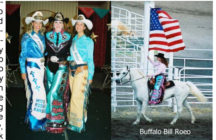
Buffalo Bill Rodeo

American Flag into my hometown arena where I grew up riding horses. NebraskaLand Days...what a 10-day celebration! There was something going on at all times of the day during this event. Thank you to my escorts for getting me to where I needed to be and to my Lil' Cowgirls for their help with all the different activities! Some highlights for me were attending the Cowboys & Crystals Wine Tasting, Governor's Art Show, VIP Luncheon, and the Pork